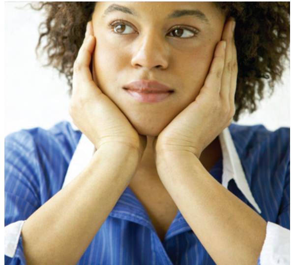
The Holy Spirit is the voice of conscience in people.

Have you ever had calluses on your hands? How did you get them? As you worked on a project, at first your hands were sore. But after a while they began to toughen, until one day you could feel nothing when you worked. It's the same with the conviction of the Holy Spirit. The more we resist, the more we harden ourselves to the wooing of the Spirit and as such we are heading toward committing the "unpardonable sin," the sin God cannot forgive.