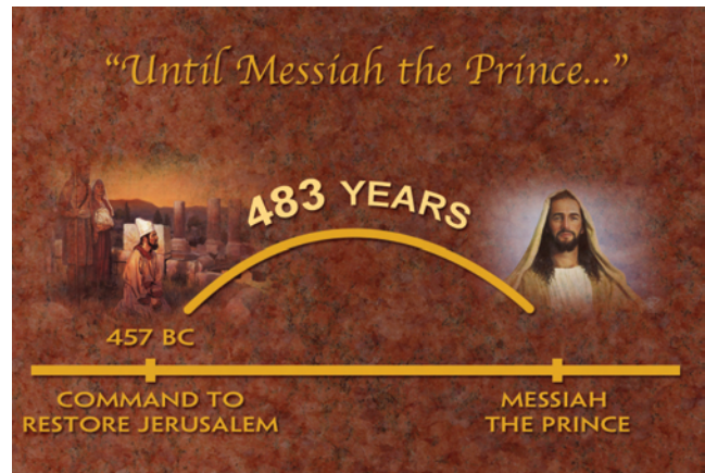
Jesus, the Messiah, came exactly on time to fulfill Bible prophecy.

To put it simply, Daniel is told that in 70 weeks something is to happen to the Jews and to their city, Jerusalem. Now 70 weeks is just a little over a year, 490 days. But in Bible prophecy a day represents a year. (Num. 14:34; Ez. 4:6) So God said to Daniel that something significant was going to happen in 490 years. 490 years from when? The Bible tells us that too: “Know therefore and understand, that from the going forth of the command to restore and build Jerusalem until Messiah the Prince, there shall be seven weeks and sixty-two weeks” or 69 weeks. (Daniel 9:25)