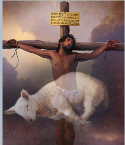
Every sacrificial animal was a symbol of Jesus.

Not only does the Bible tell us that Jesus would die for our sins, but through prophecy, it also tells us when He would die!