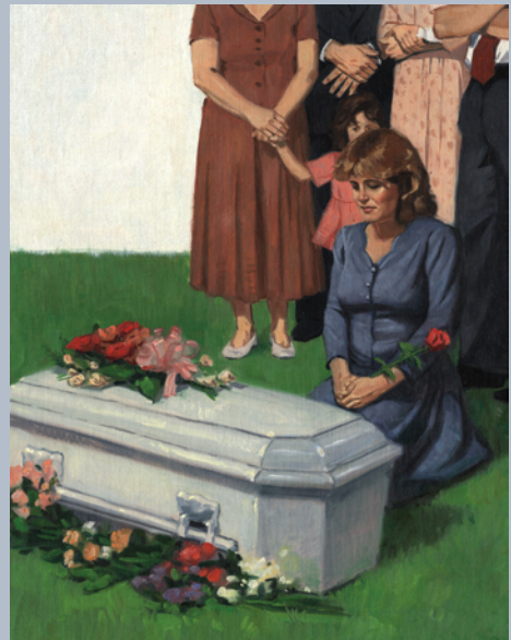
What does the Bible teach about death and life after death?