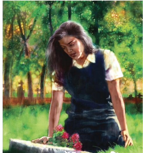
Death is a sleep in which one goes to the grave and remains unconscious until the coming of Christ.

Are the dead in heaven or sleeping in the grave? They are sleeping in the grave! They know nothing because they are asleep. Remember the story of Lazarus? When Jesus heard that Lazarus had died, what did He say? “Our friend Lazarus sleepeth; but I go, that I may awake him out of sleep. Then said his disciples, ‘Lord, if he sleep, he shall do well.’ Howbeit Jesus spake of his death: but they thought that he had spoken of taking of rest in sleep. Then said Jesus unto them plainly, Lazarus is dead.” (John 11:11-14) It is clear from the Bible, despite what you may have heard elsewhere, that the dead are asleep.