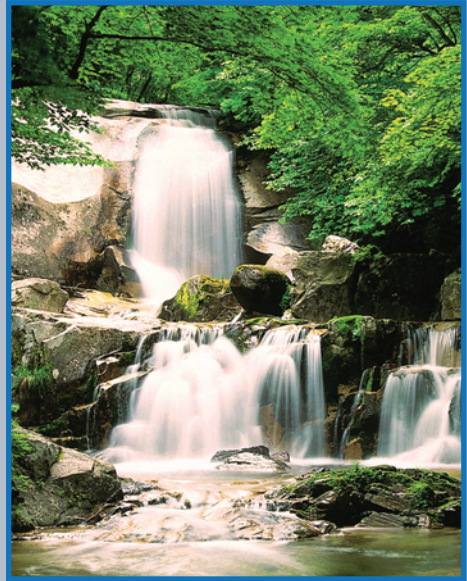
The fingerprints of a Creator God are all around us.

If you see a house, do you ever assume that somehow the house just made itself? Of course not! You realize that someone designed and built it. If you see a road, do you ever think that the road just made itself or that someone made it? Obviously someone made it, right? And roads and houses are far more simple than worlds or people! And when you look at people, animals, and stars, doesn't it just make sense to conclude that someone made them all? That someone designed and created them? So, as we begin to learn about the God who claims to be the Designer and Creator of everything, let's start with what the Bible says about His work in creating this earth and our universe in just one literal week.