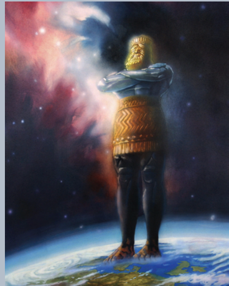
The image of Daniel chapter 2 gives a panoramic view of history.

In times past, people did all kinds of strange things to know the future. For instance, some would try to predict the future by how sunlight reflected off of a person's fingernails. Others would