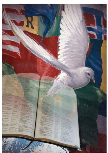
"This gospel of the kingdom shall be preached in all the world."

The God of heaven is not influenced by popular opinion. He simply tells us, "And this gospel of the kingdom shall be preached in all the world for a witness unto all nations; and then shall the end come." (Matthew 24:14) What is that gospel message? First, we find in the New Testament a call to worship the Creator God. "For by him were all things created, that are in heaven, and that are in earth, visible and invisible.... all things were created by him, and for him: And he is before all things, and by him all things consist." (Colossians 1:16, 17)