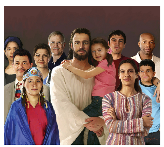
God's church loves Jesus and keeps His commandments.

So we see that God's message for the world is salvation by accepting Jesus as our Savior. Then, from a grateful response of love to our Lord, we are called to obey His