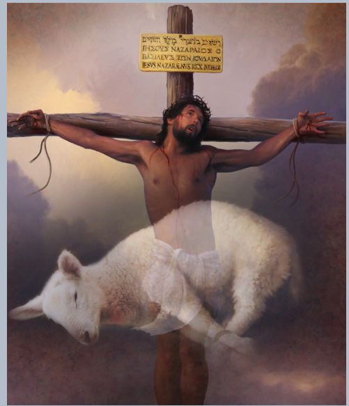
Every sacrificial animal was a symbol of Jesus.

Not only does the Bible tell us that Jesus would die for our sins, but through prophecy, it also tells us when He would die!