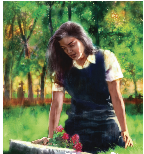
Death is a sleep in which one goes to the grave and remains unconscious until the coming of Christ.

Let’s summarize what we have learned: First, death came because of sin and death is a sleep in which one goes to the grave and remains unconscious until the coming of Christ. Secondly, Jesus died for our sins on the cross and rose from the dead to prove He had power over death. Thirdly, at His second coming He will raise the righteous dead and give them immortality. (Read 1 Thess. 4:13-18; 1 Corinthians 15:51-58).