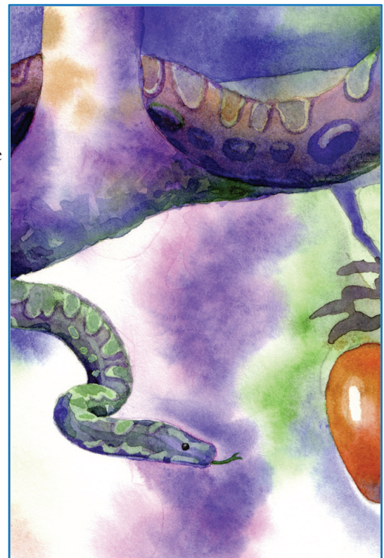
The first lie that Satan told was about death.