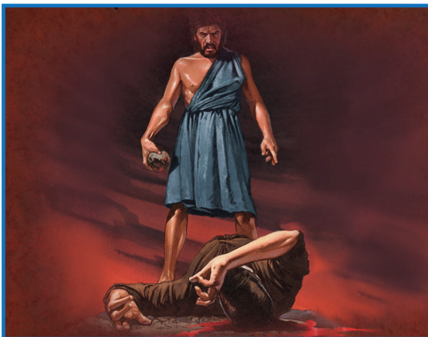
Cain knew murder was wrong.

Years ago a debate on moral values took place between an atheist and a Christian. The atheist insisted that moral values came only from a person's feeling, nowhere else. The Christian said that moral values came from God. The Christian finally answered, "Sir, in some societies people love their neighbors, in others they eat them, all based on feelings and the promptings of their hearts. Which society would you prefer to live in?"