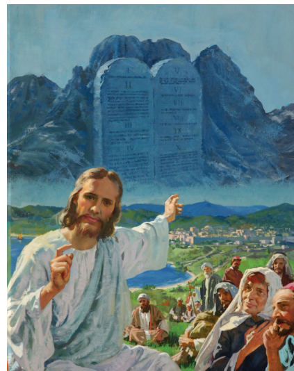
Jesus said that not even the least commandment should be broken.

But what about the New Testament? Didn't Jesus come to abolish the law? Actually, the New Testament teaches repeatedly that sin is breaking God's law. Here's one example: "Whosoever committeth sin transgresseth also the law: for sin is the transgression of the law." (1 John 3:4) Here is another New Testament text, also written after the death of Jesus. "Awake to righteousness, and sin not." (1 Corinthians 15:34) So we can see clearly that in the New Testament the law of God was still in effect. Jesus Himself said: "For verily I say unto you, Till heaven and earth pass, one jot or one tittle shall in no wise pass from the law, till all be fulfilled. Whosoever therefore shall break one of these least commandments, and shall teach men so, he shall be called the least in the kingdom of heaven: but whosoever shall do and teach them, the same shall be called great in the kingdom of heaven." (Matthew 5:17)