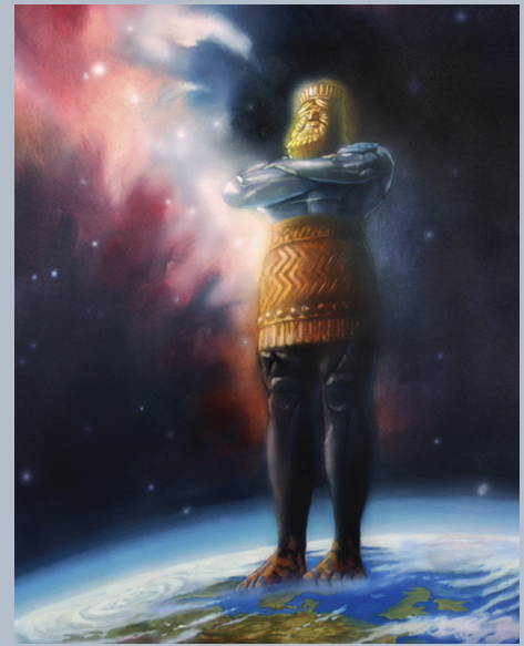
The image of Daniel chapter 2 gives a panoramic view of history.

In times past, people did all kinds of strange things to know the future. For instance, some would try to predict the future by how sunlight reflected off of a person's fingernails. Others would