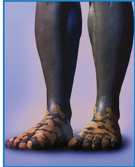
The Roman Empire would never be united.

Napoleon, Kaiser Wilhelm and Hitler have tried to